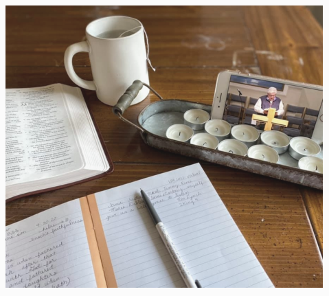
Ladies' Prayer Advance

A group of eight ladies from our faith family attended this year's Ladies' Prayer Advance. Many of them were exposed to COVID the week before the advance, but thanks to the virtual option, nobody who registered had to miss out on this deeply impactful event. The theme was "Revitalize!" and we are looking forward to the ladies' personal testimonies of how God used this weekend to rejuvenate their hearts, prayer life, and daily walk with Christ.