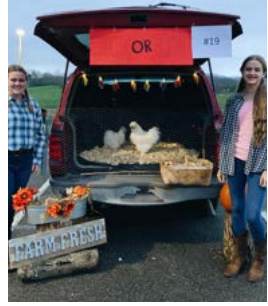
And the live chickens in this trunk (right) were a massive crowd-pleaser!

On Wednesday, October 28th, we held our annual Trunk-or-Treat at the Homeplace Restaurant. In the past, Trunk-or-Treat has been one of our largest community outreach events, but with health and safety regulations in place due to COVID-19, we knew we had to be creative to host this event. So this year, we designed a drive-thru style Trunk-or-Treat, and over 180 vehicles (at least 600 attendees!) drove through our event! We are still praising God for the awesome outreach to our community, and the support they showed us by coming out. Trunk-or-Treat 2020 held an endless supply of candy and fun for the community. But most importantly, each vehicle that drove through left with a note of appreciation and a short gospel presentation! We also sent out 30 follow-up letters to new families who had registered for the event that night. Along with our many guests, we had many volunteers involved in this endeavor, from those who directed traffic, worked at our welcome station, to the many who dressed up and decorated their trunks. Without you, this awesome night wouldn't have been possible!