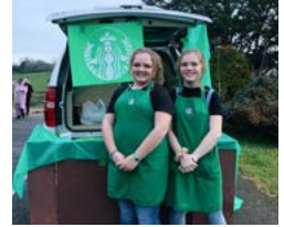
A stiff rivalry occurred between Dunkin' Donuts and Starbucks themed trunks...